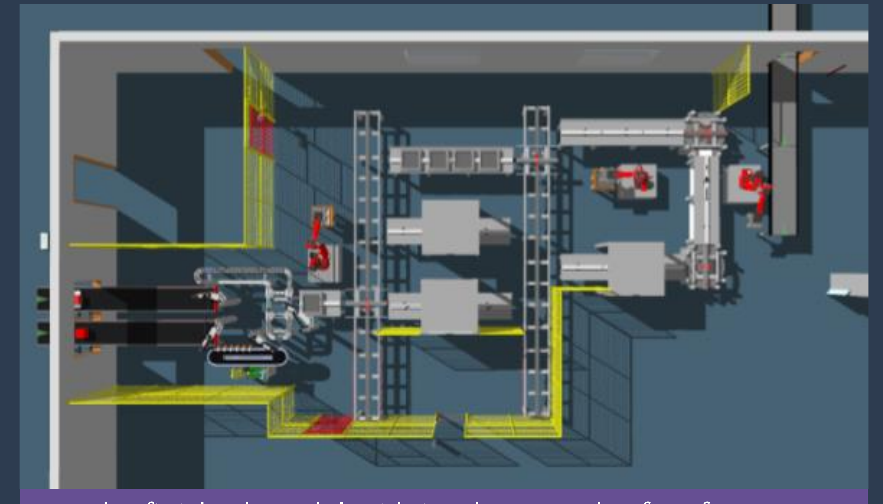
The finished model with implemented safety features

Although digital twins are not a recent technology, they have seen increasing relevancy in recent years. With this technology, remotely collaborating on development and design of processes may be easier than ever before. Despite digital twins being a powerful tool for developing, physical meetings are unlikely to go anywhere due to the social cohesion among colleagues which they bring.